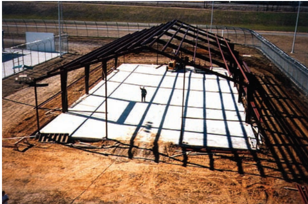
Built to last 100 years, using steel frame and steel siding on a concrete slab.